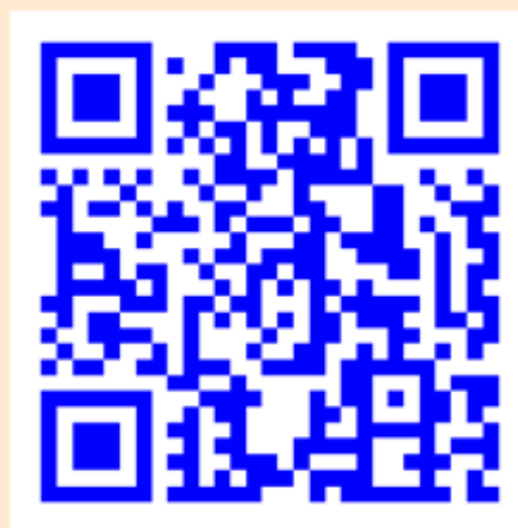
TBDG Facebook Group