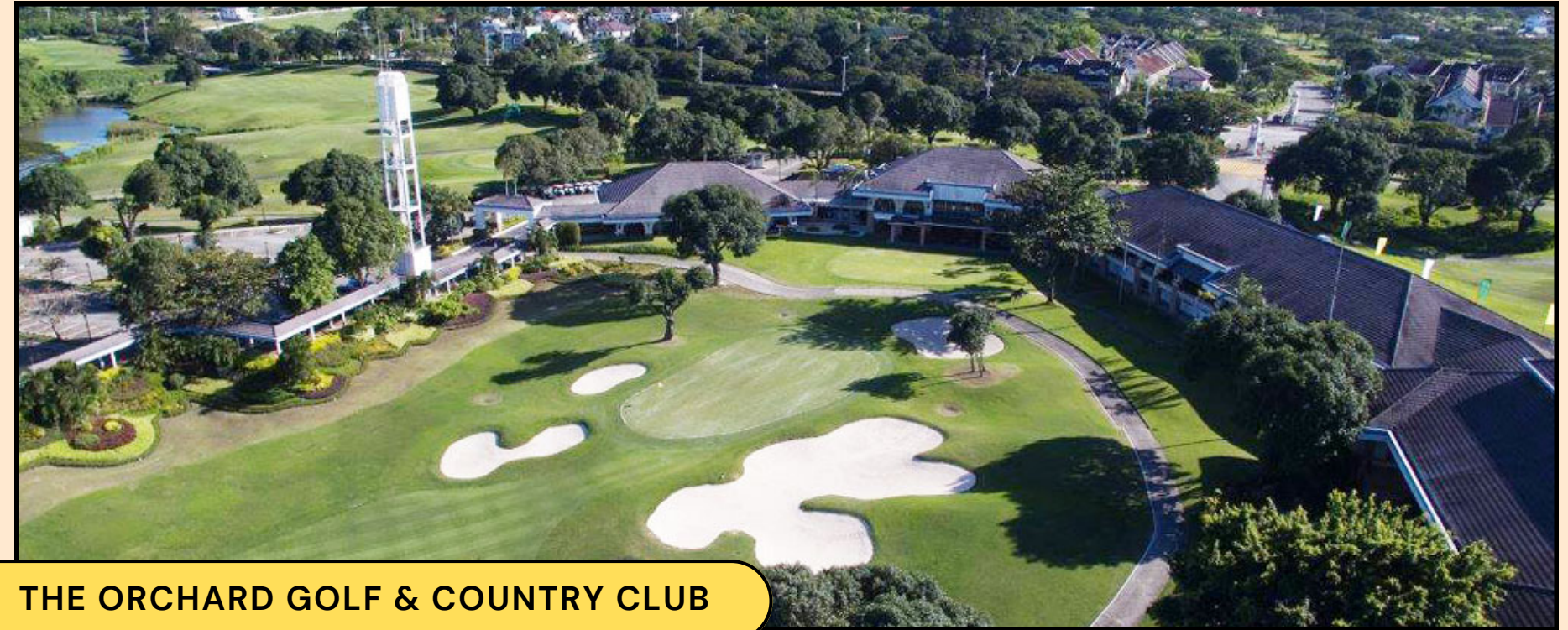
THE ORCHARD GOLF & COUNTRY CLUB