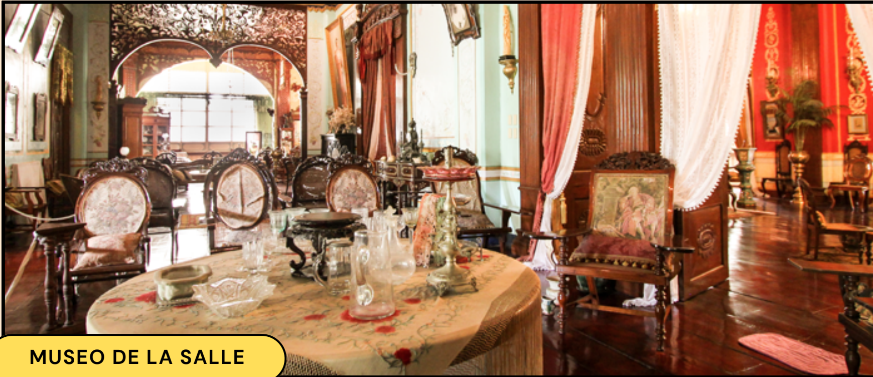
MUSEO DE LA SALLE