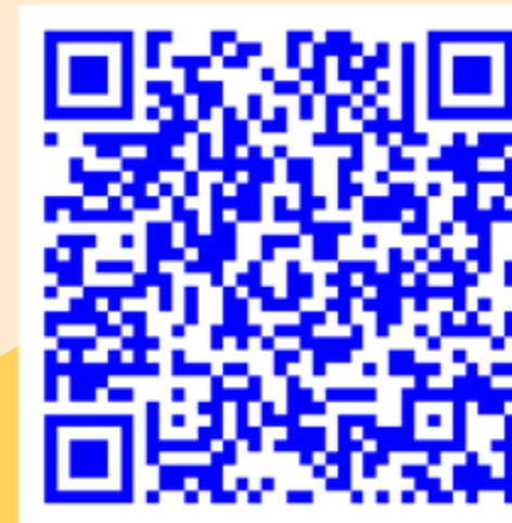
TBDG Linked In