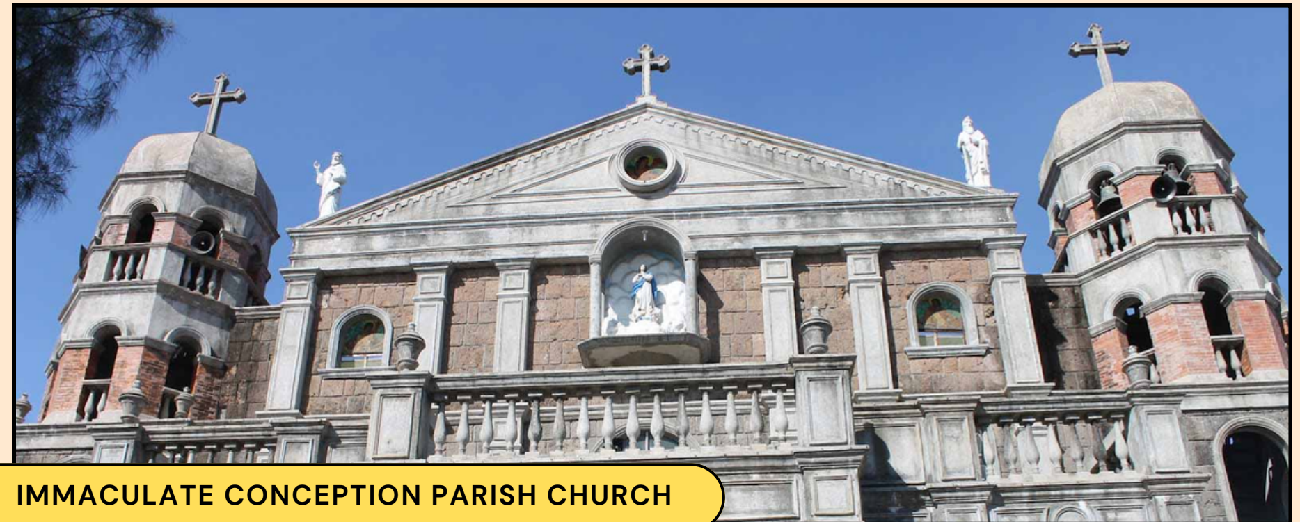
IMMACULATE CONCEPTION PARISH CHURCH